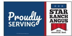
Static cling Proudly serving TFM21-010