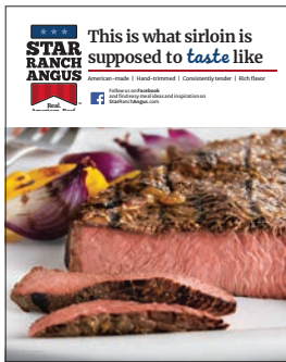
Poster Sirloin TFM21-027

1 in 3 shoppers purchase USDA grade Choice Angus at least once a month. 1 Our eye-catching photography and bold messaging keep Star Ranch Angus beef front of mind where it counts the most — the meat case.