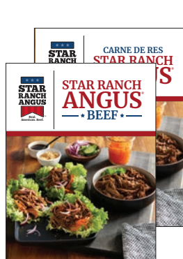
Brand brochures English & Spanish