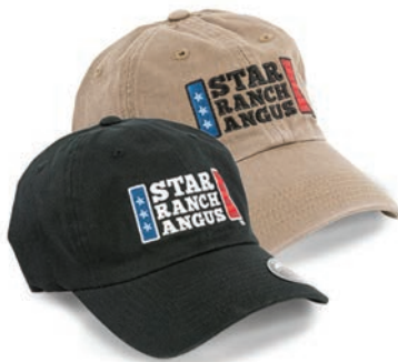
Hats TFM21-015 TFM21-014