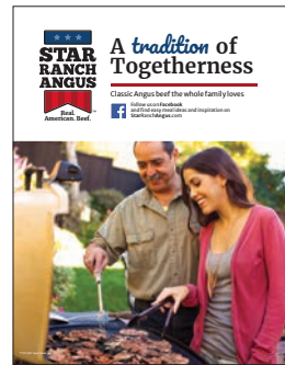
Poster Bilingual TFM21-026