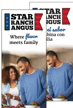
Recipe brochures English & Spanish TFM21-031