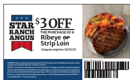
Coupons available upon special request On-Pack & Tear Pad TFM21-034 TFM21-035