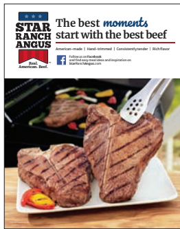
Poster T-Bone TFM21-028