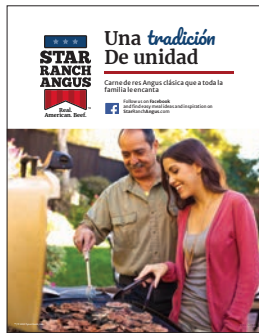
Poster Bilingual TFM21-026